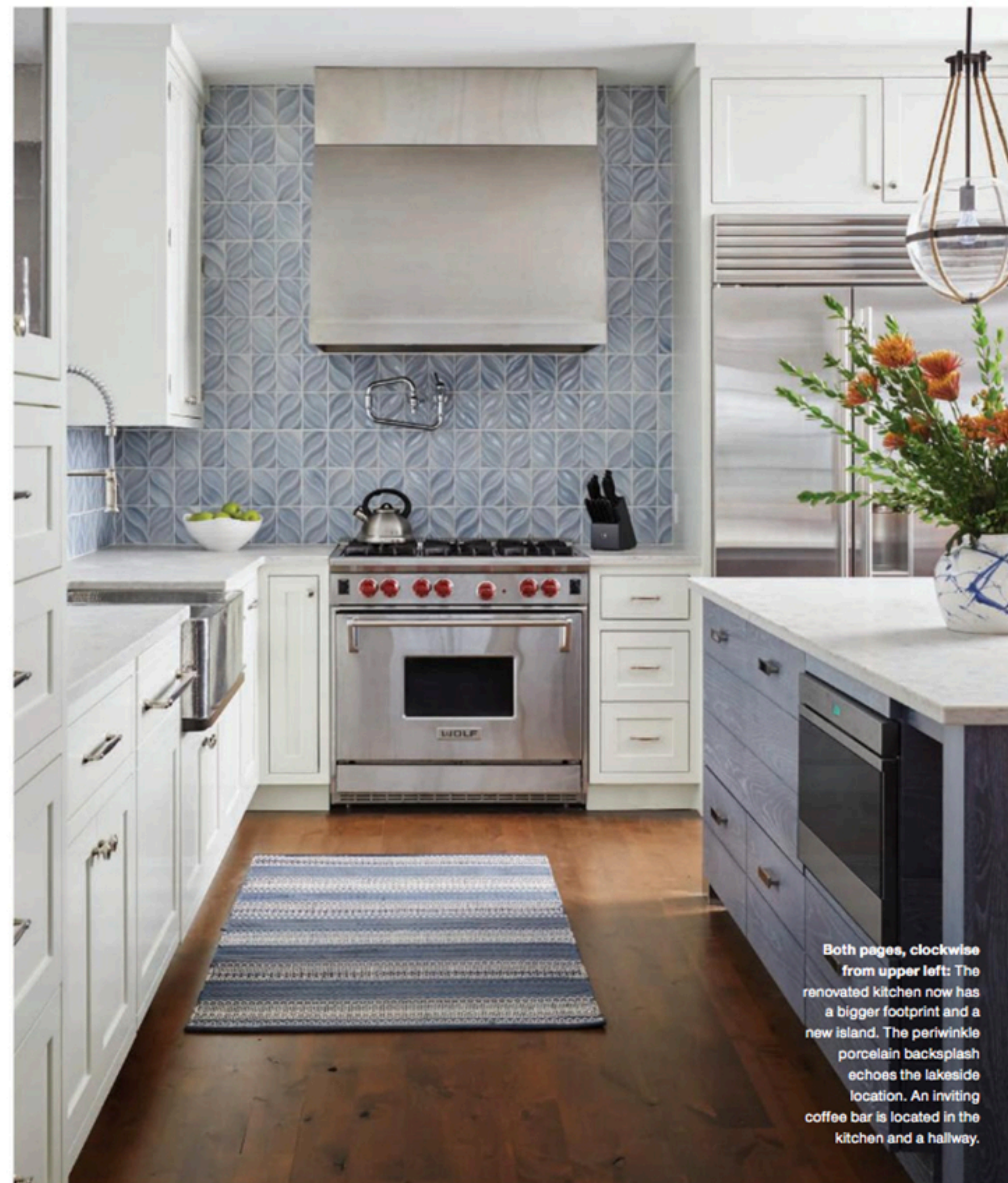
Both pages, clockwise from upper left: The renovated kitchen now has a bigger footprint and a new island. The periwinkle porcelain backsplash echoes the lakeside location. An inviting coffee bar is located in the kitchen and a hallway.