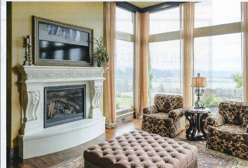
In main living areas, use moving artwork to hide technology not in use, such as your television.

Every homeowner has personal preferences for how much technology they want designed into their everyday lives.