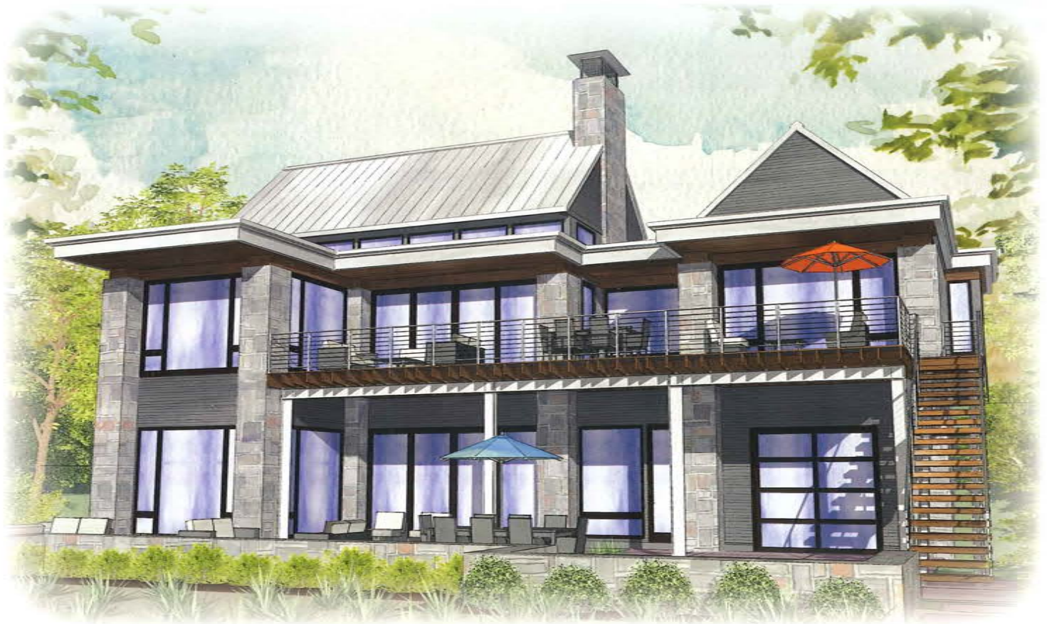
ILLUSTRATION BY BRAD TILMA/BRAD DOUGLAS DESIGN

Michigan shore; a home that would offer a lakefront respite, space for their adult children to visit and plenty of space to enjoy the luxuries of living at the water's edge.